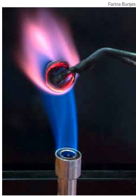
Figure 4: Observation of flame colours while burning dried mushrooms. Left: a typical flame colour in the presence of sodium; right: after a while, a mixed flame colour with the typical lilac due to potassium is visible.