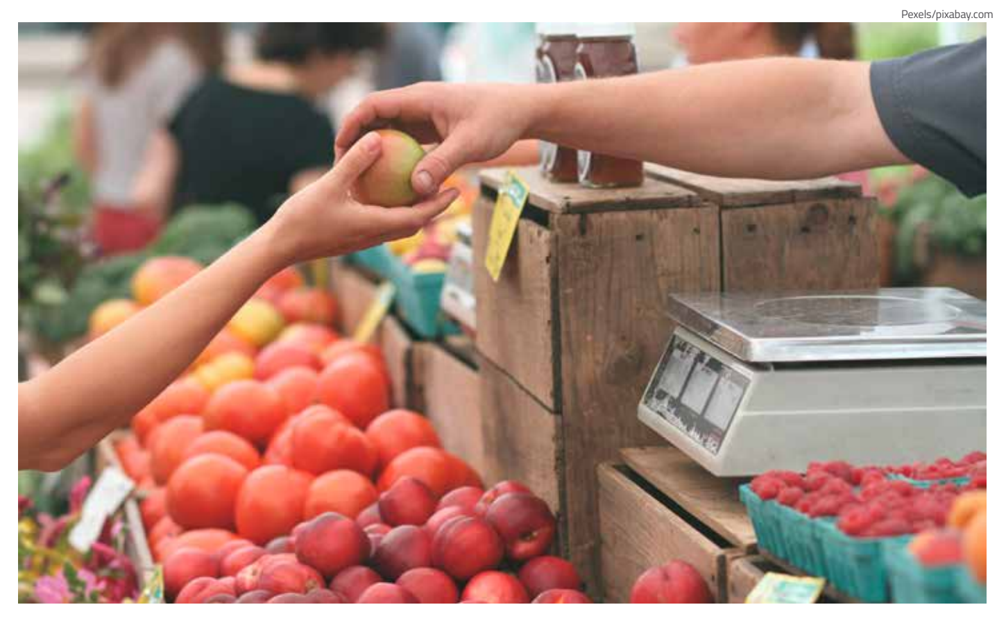
Farmers' markets have become popular in many countries, and are associated with a more 'natural' and sustainable lifestyle.