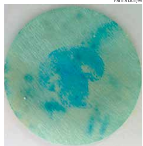
Figure 3: Left: iron(III) chloride filter paper with mushroom print; right: after treatment with potassium hexacyanoferrate(III) solution, showing presence of vitamin C in the mushroom print