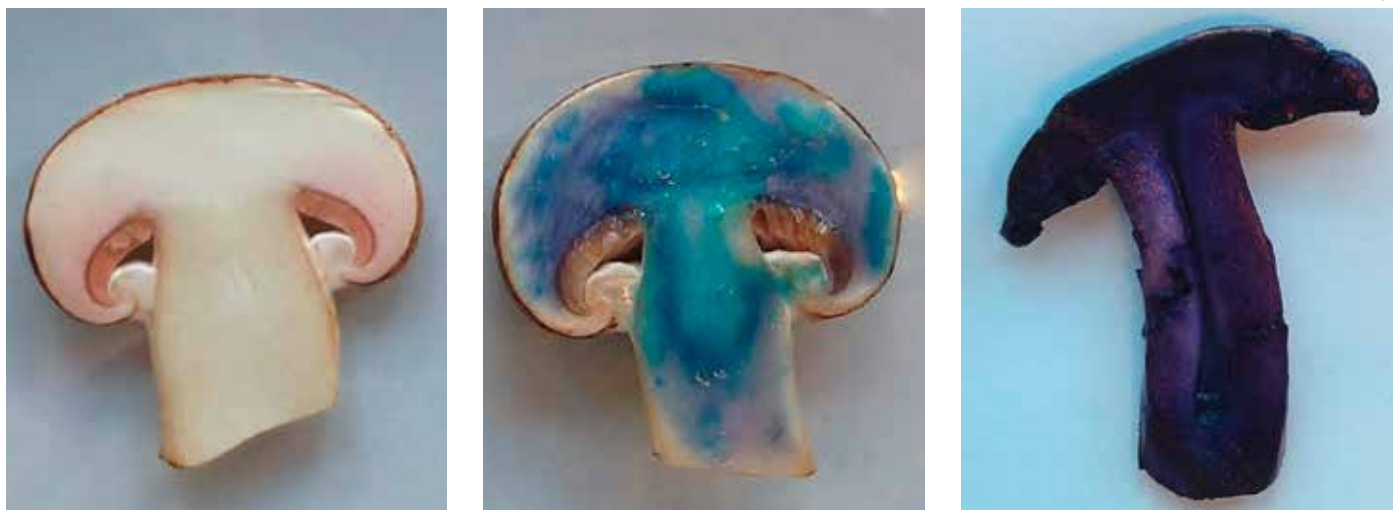
Figure 2: Left: fresh, untreated mushroom; middle: positive Buiret reaction; right: positive ninhydrin reaction

Mushrooms contain significant amounts of vitamin C (about 2.1 mg per 100 g of fresh mushrooms), plus some B vitamins (including B1, B2, B6 and the amide of niacin, B3). Mushrooms are also rich in nicotinamide (5.2 mg per 100 g of mushrooms).