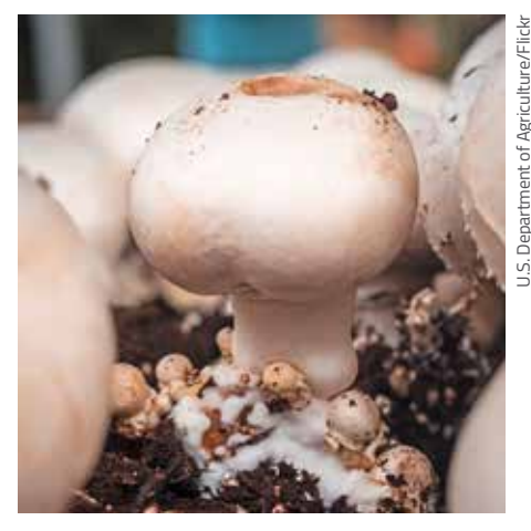
Figure 1: The fruiting body of a cultivated mushroom

Proteins can be detected using both the Biuret and the ninhydrin tests. These procedures are described here separately.