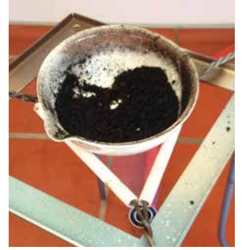
Mushroom ash, produced by burning dried mushrooms

Figure 4: Observation of flame colours while burning dried mushrooms. Left: a typical flame colour in the presence of sodium; right: after a while, a mixed flame colour with the typical lilac due to potassium is visible.